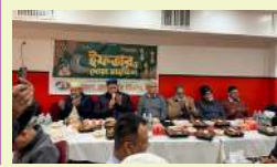
Faith and Recognition Unite at Netrokona Society Iftar