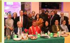
A Night of Unity in Brooklyn