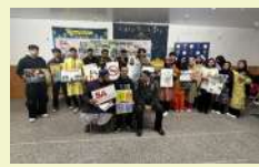
Young Voices Lead the Conversation on Public Safety in Queens