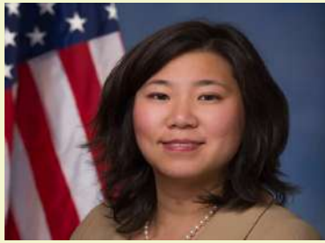
Photo: U.S. Rep. Grace Meng was endorsed by State Sen. John Liu, a longtime partner in Queens politics, in the 2026 election.