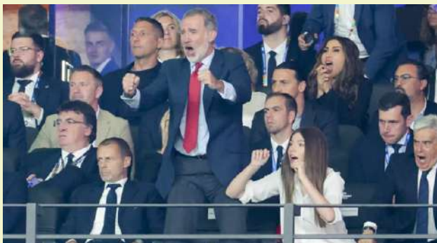
Photo: The Spanish monarch (centre) is a keen football fan and is said to be an avid Atlético de Madrid supporter Image Source: Getty Images/BBC

World Cup gesture signals diplomatic thaw