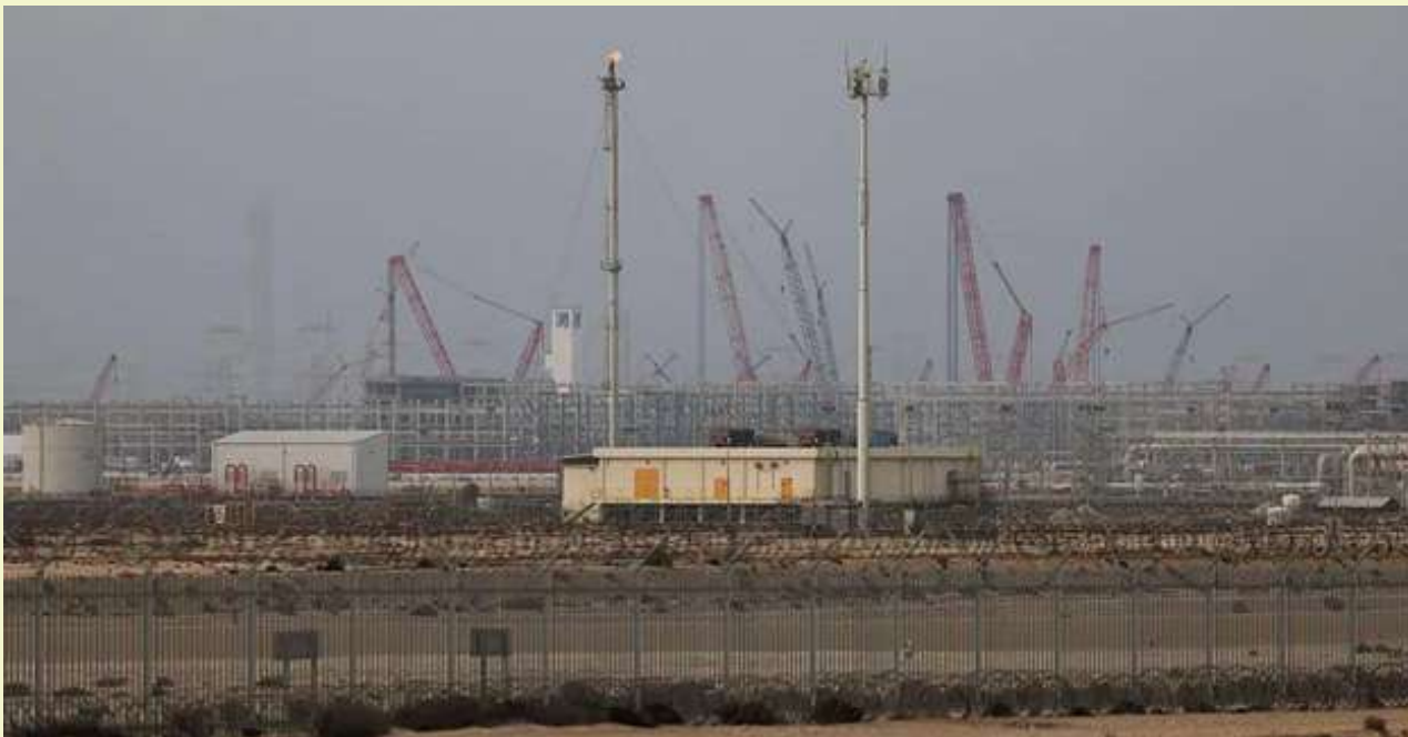
Photo: Ras Laffan is the largest LNG export facility in the world