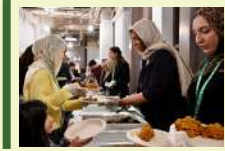
Attorney General hosts Iftar at Islamic Center NYC