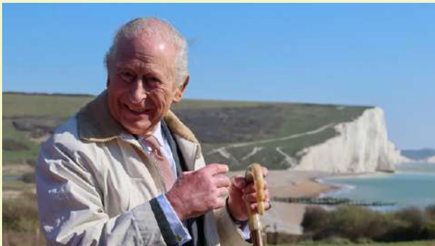
Photos: 2,689 miles and 18 years in the making, King Charles III opens his namesake coastal path

King Charles III has officially inaugurated the King Charles III England Coast Path, a landmark 2,689-mile trail that now forms the world's longest managed coastal walking route. The newly completed path creates, for the first time, a continuous route around England's entire coastline, allowing walkers to explore landscapes ranging from sandy beaches and salt marshes to dramatic cliffs and historic towns. The King marked the occasion at an event hosted by the South