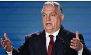
Photo: Viktor Orbán's last-minute blockade of a €90bn loan for Ukraine has infuriated other EU leaders.

A tense standoff unfolded at a European Union summit in Brussels on Thursday as Hungarian Prime Minister Viktor Orbán refused to approve a crucial €90bn (£78bn) loan package intended to support Ukraine's military and government operations. EU leaders openly expressed frustration, accusing Orbán of backtracking on a previously agreed plan and undermining unity at a critical moment in the war. Kaja Kallas, the EU's foreign policy chief, said Hungary was "not acting in good faith," while Finland's Prime Minister Petteri Orpo described the move as a "betrayal." Orbán defended his position, citing a dispute over the Druzhba oil pipeline, which transports Russian oil to Hungary and Slovakia through Ukraine. He insisted he would not support funding for Kyiv until Hungary regains access to its oil supply. The impasse has delayed urgently needed financial assistance, with EU officials hoping to release funds by early April. Meanwhile, leaders including Belgium's Bart De Wever and European Council President António Costa criticized Hungary's stance as "unacceptable." The disagreement highlights growing divisions within the EU as it seeks to maintain support for Ukraine while navigating internal political tensions and energy concerns.