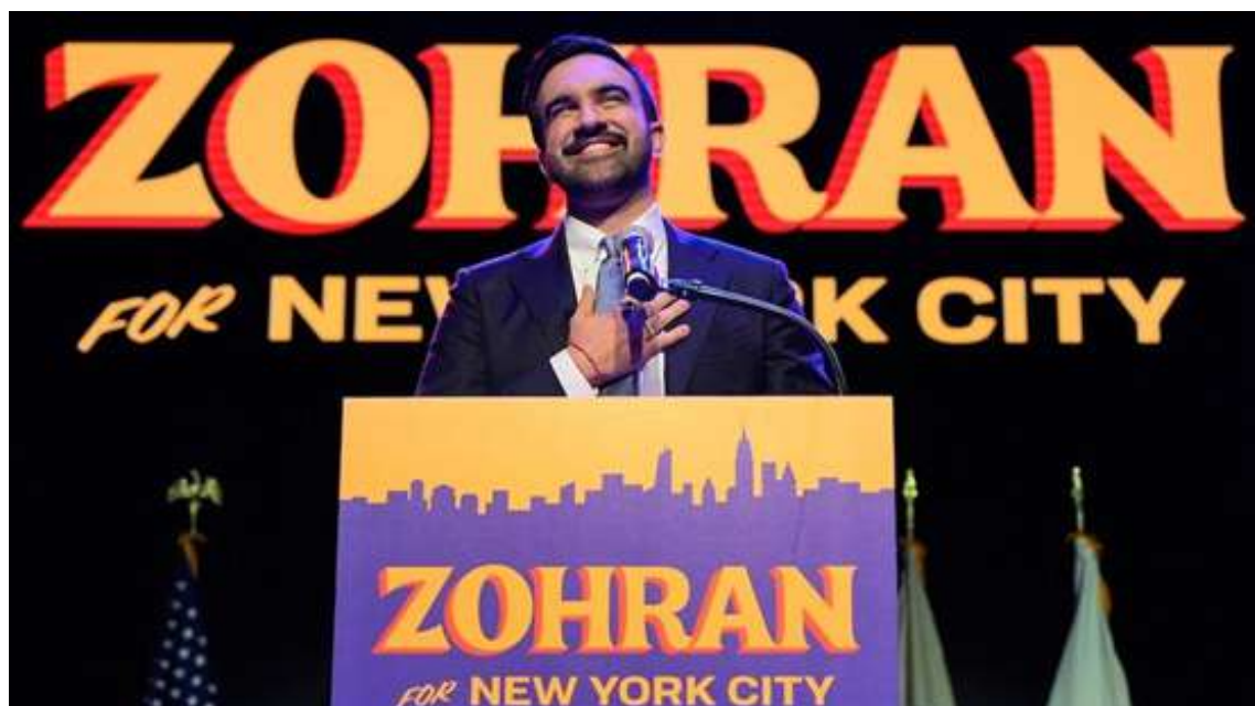
Photo: Zohran Mamdani, newly Elected NYC Mayor

“Our campaign had clear values: we wanted to bring power to people who didn't have power.”