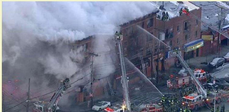
Photo: 5-alarm fire erupted in Van Nest on Saturday, Nov. 9.

A devastating five-alarm fire tore through the Van Nest neighborhood of the Bronx on Saturday, November 9, destroying multiple homes and businesses and leaving 16 people homeless, according to the Red Cross. The fire broke out around 11:30 a.m. at a commercial property near 9407 Kings Highway and quickly escalated. It took several hours for FDNY crews to bring the blaze under control. During the response, four firefighters sustained minor injuries. By Sunday morning, the aftermath was stark. Gates cordoned off the area, and piles of debris — bricks, charred car parts, and twisted