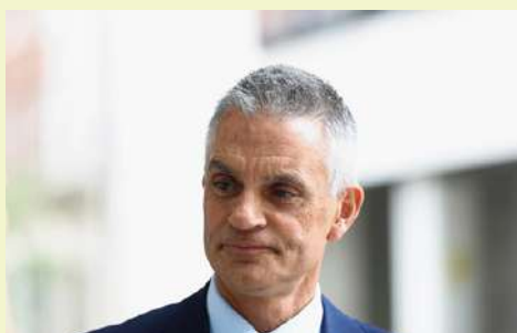
Photo: BBC Director-General Tim Davie and US President Trump

a portion of Trump's January 6, 2021, speech but omitted his call for supporters