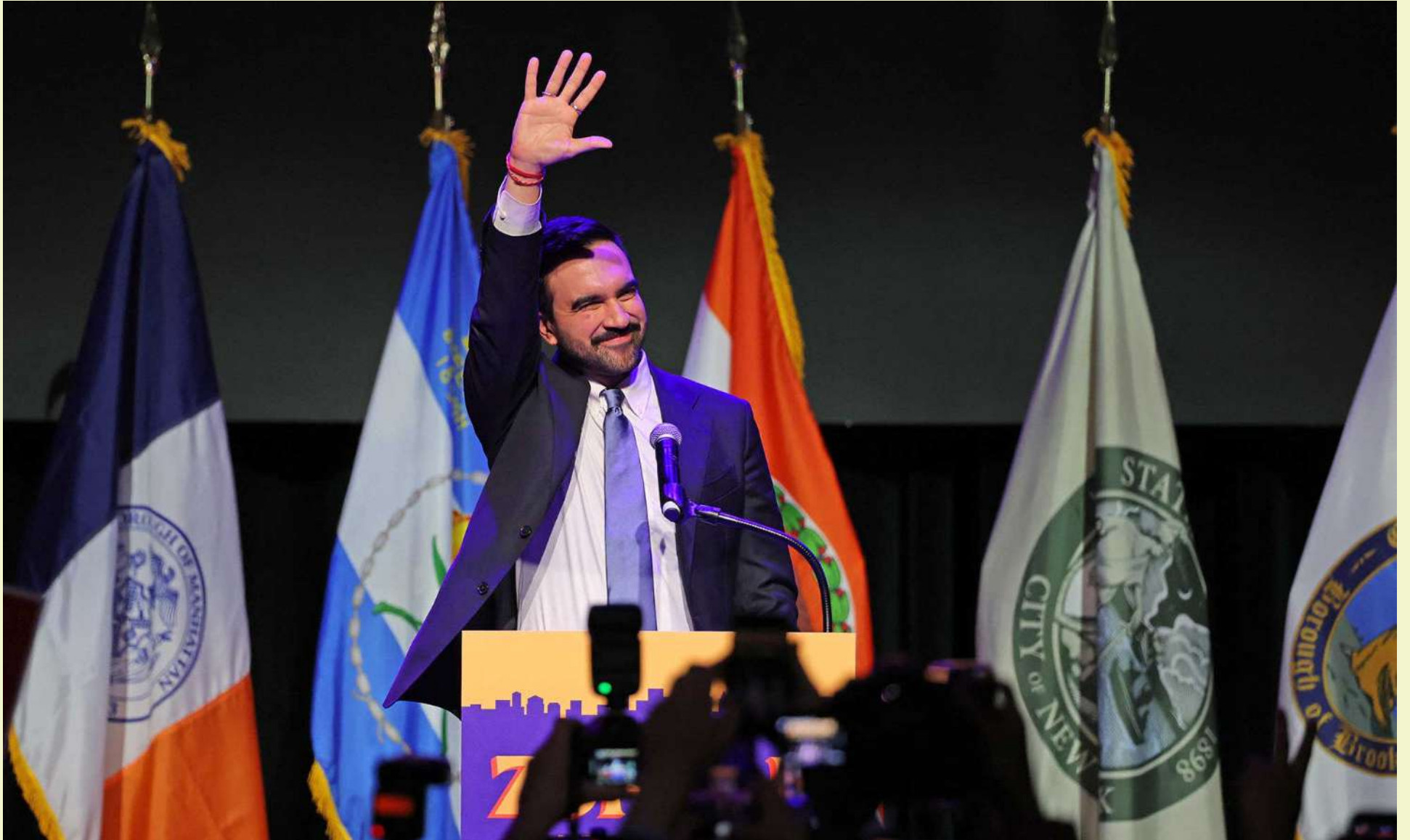
Photo: Newly Elected NYC Mayor Zohran Mamdani

First Muslim, South Asian Mayor of New York City