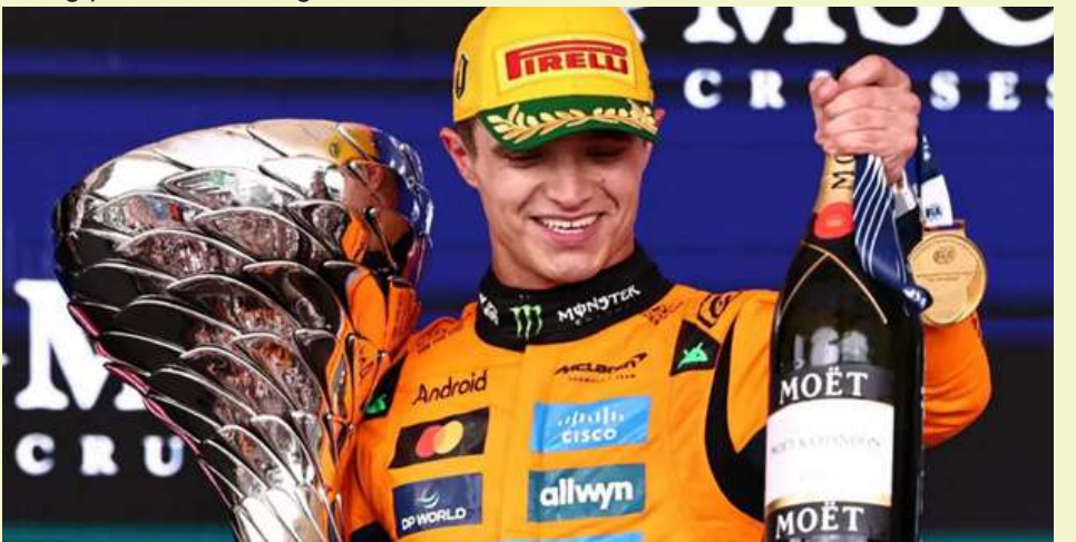
Photo: Lando Norris has now outscored McLaren team-mate Oscar Piastri in six successive grands prix

collision involving Kimi Antonelli and Charles Leclerc, further denting his fading title hopes as he finished fifth. Norris dedicated his win to Gil de Ferran, the late former McLaren advisor. With just three races left in Las Vegas, Qatar, and Abu Dhabi, McLaren's rising star edges closer to his first world title, while Piastri and Verstappen scramble to keep pace.