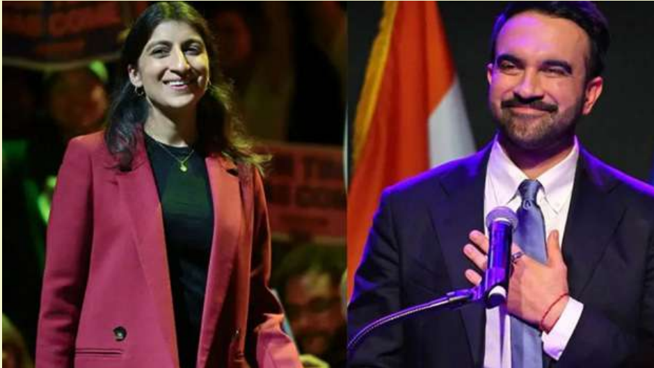
Photo: Pakistani-American legal scholar Lina Khan and Newly Elected NYC Mayor Zohran Mamdani

Lina Khan Brings Antitrust Focus to New York's Future