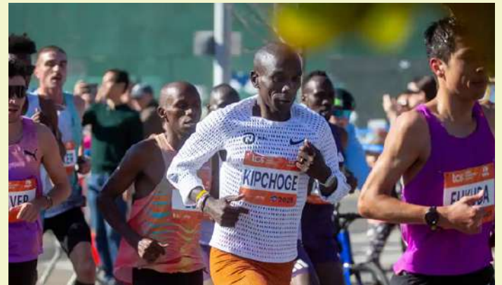
Photo: Eliud Kipchoge leading the professional men's field at his final professional marathon in Long Island City.