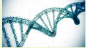
Photo: Scientists have edited a gene that may reduce high cholesterol permanently

In a groundbreaking advance, scientists have successfully used CRISPR-Cas9 gene editing to permanently reduce LDL cholesterol levels, potentially eliminating the need for lifelong medication. The pilot study, published Saturday in The New England Journal of Medicine and presented at the American Heart Association Scientific Sessions in New Orleans, involved 15