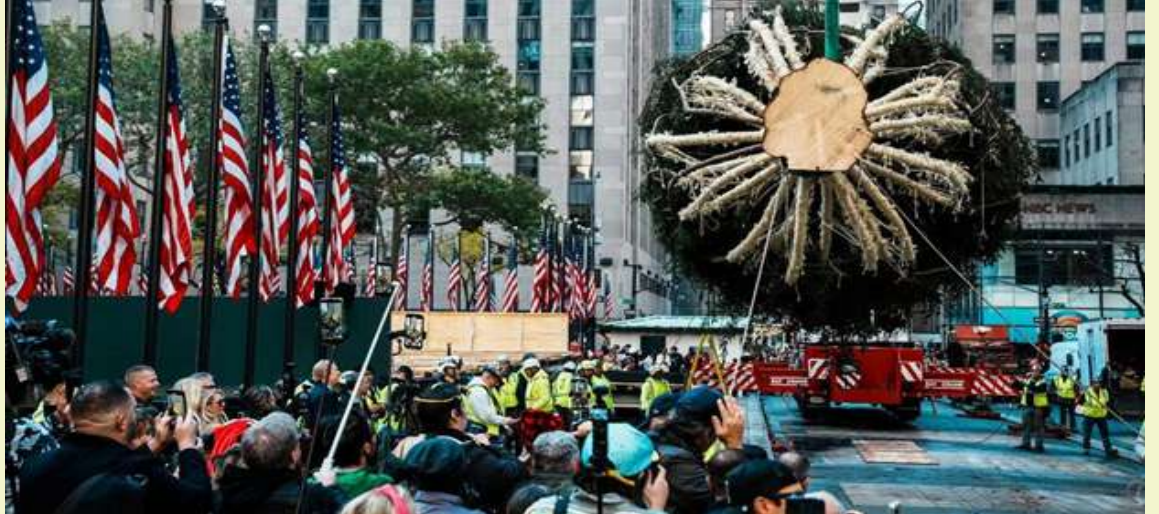
Photo: Workers hold the Rockefeller Center Christmas tree with ropes at Rockefeller Plaza, Saturday, Nov. 8, 2025, in New York.