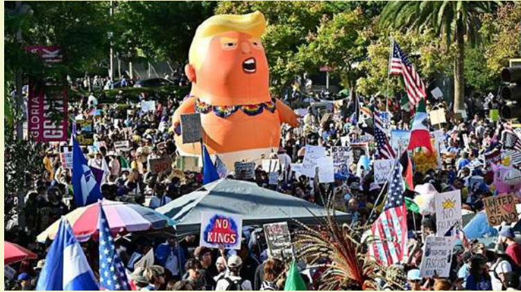
Photo: The Donald Trump "baby blimp", which has become a common sight at protests over the years, made an appearance in Los Angeles

Square, Washington, D.C., Chicago, and Los Angeles, carrying signs that read "Democracy not Monarchy" and "The Constitution is not optional."