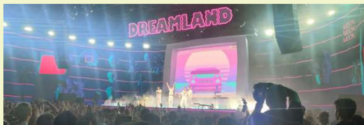
Photo: Glass Animals perform at the Brooklyn Mirage in August 2022.

The demolition request, filed by Avant Gardner LLC, targets 32,000 square feet of the venue's sprawling 80,000-square-foot temporary structure on Stewart Avenue in East Williamsburg. The move comes after the New York City Department of Buildings deemed the site unsafe in May 2025, leading to the abrupt cancellation of scheduled performances.