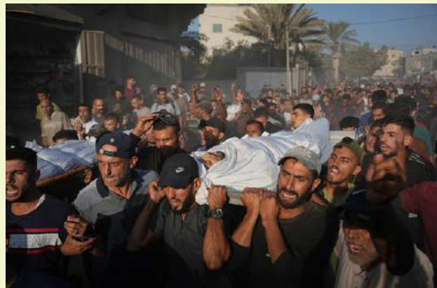
Photo: Mourners carry bodies of Palestinians killed by Israeli fire, during their funeral in Deir al-Balah, Gaza Strip, Sunday, Oct. 19, 2025