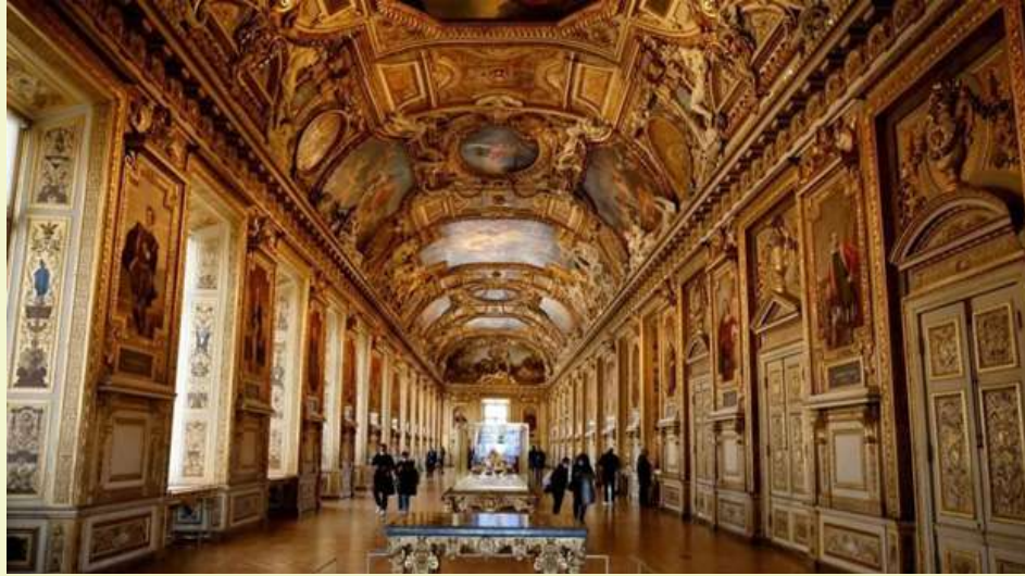
Photo: The Louvre Museum in Paris

French authorities are investigating a high-profile heist at the Louvre Museum, where masked thieves made off with priceless royal jewels in a daylight raid Sunday morning. Between 9:30 and 9:40 a.m., the gang gained entry to the Galerie d'Apollon by scaling a mechanical ladder and cutting through a first-floor window. Using power tools, they smashed open display cases and escaped on scooters, all within minutes. Culture Minister Rachida