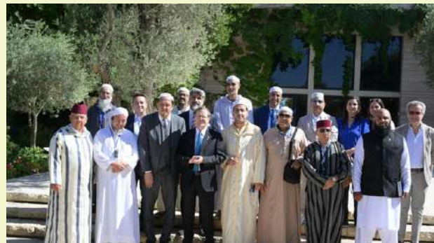
Photo: President Isaac Herzog meets with Muslim leaders at the President's Residence in Jerusalem.

criticism from several Muslim institutions. Al-Azhar and the