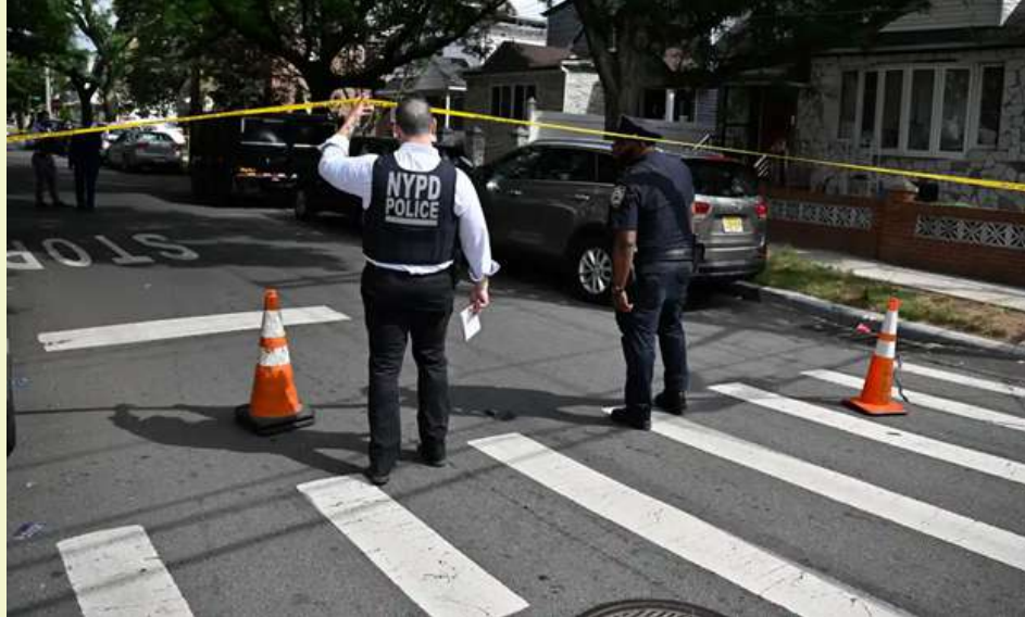
Photo: Queens detectives search for a suspect in a deadly July 12 shooting.

A 41-year-old man was fatally shot in an apparent drive-by early Saturday morning in South Jamaica, shaking residents of the normally quiet neighborhood. The incident occurred around 8:12 a.m. near the intersection of 110th Avenue and Liverpool Street, according to NYPD reports. Responding to a 911 call, officers from the 103rd Precinct found the victim, later identified as Dwayne Belfield of East 27th Street, Brooklyn, with a gunshot wound to the chest. He was rushed to Jamaica