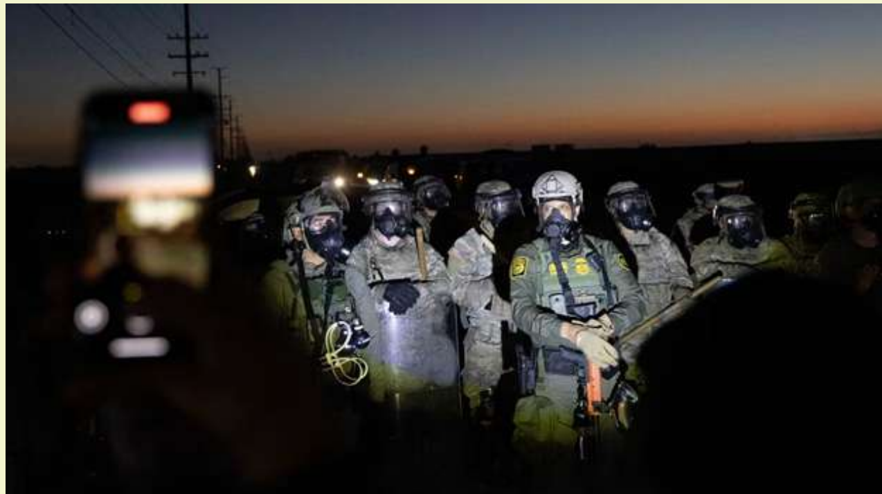
Photo: Customs officers and National Guard troops face protesters with flashlights after an immigration raid at Glass House Farms, Camarillo, California, on July 10.

disapproval of both his handling of immigration and the surge in ICE operations. A Gallup survey conducted in June revealed that 62% of Americans disapproved of Trump's management of immigration, compared with 35% who approved—his lowest