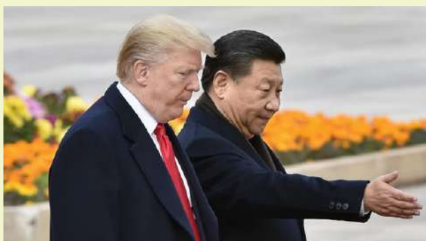
Photo: Xi Jinping and Donald Trump walk during a 2017 state visit welcome ceremony in Beijing.

In a strategic shift, China recently added two fentanyl precursor chemicals and the powerful synthetic opioid class known as nitazenes to its list of controlled substances, aligning with international drug control conventions. The move follows U.S. President Donald Trump's imposition of 20% tariffs on all Chinese imports—justified by his administration as a response to China's alleged role in the deadly flow of fentanyl