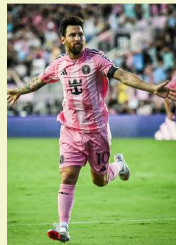
Photo: Lionel Messi celebrates after scoring.