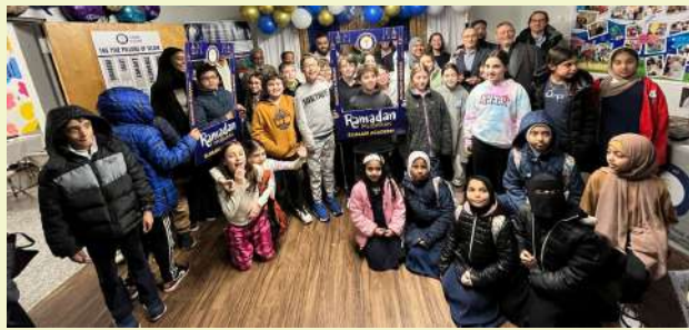
Interfaith Iftar "Hate to Hope"..... Page-06

Sunday, March 09, 2025 nyn.press Ramadan 1446 +1646 444 6644 info@nyn.press