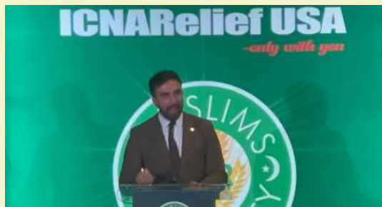
Zohran Mamdani’s Vision for New York-04

Empowering Future Leaders Through Education