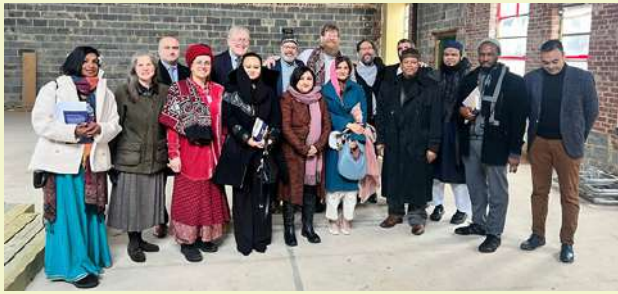
Jewish-Muslim Dialogue Event... Page-04