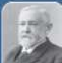
Benjamin Harrison 23rd President