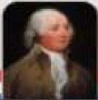
John Adams 2nd President