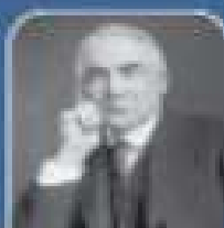
Warren G. Harding 29th President