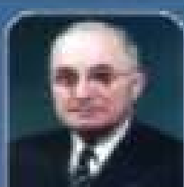
Harry S. Truman 33rd President