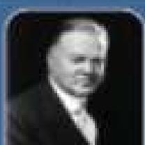
Herbert C. Hoover 31st President