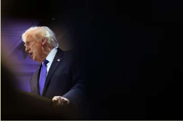
Photo: President Donald Trump speaks during a press briefing held at the White House, on Friday.

Ruling curbs president's trade authority