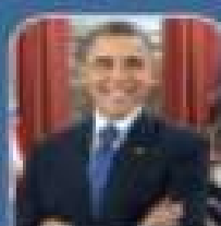
Barack H. Obama 44th President