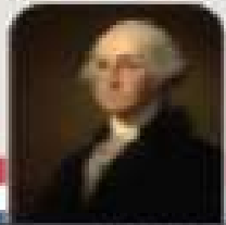
George Washington 1st President