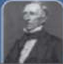
John Tyler 10th President