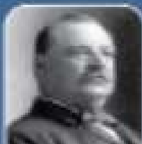
Grover Cleveland 22nd President