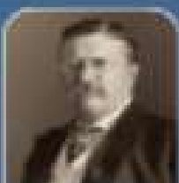
Theodore Roosevelt 26th President