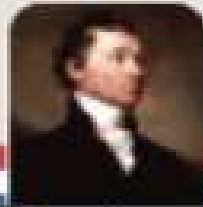
James Monroe 5th President