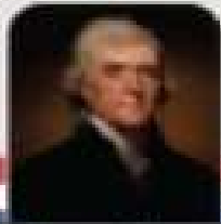
Thomas Jefferson 3rd President