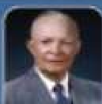
Dwight D. Eisenhower 34th President