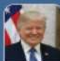
Donald J. Trump 47th President