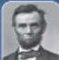
Abraham Lincoln 16th President