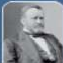
Ulysses S. Grant 18th President