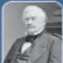
Millard Fillmore 13th President