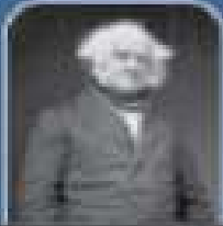
Martin Van Buren 8th President