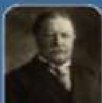
William H. Taft 27th President