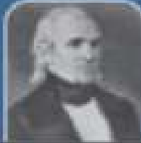
James K. Polk 11th President