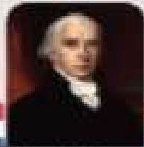
James Madison 4th President