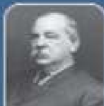
Grover Cleveland 24th President