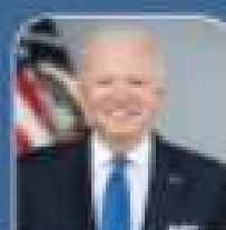
Joseph R. Biden Jr. 46th President