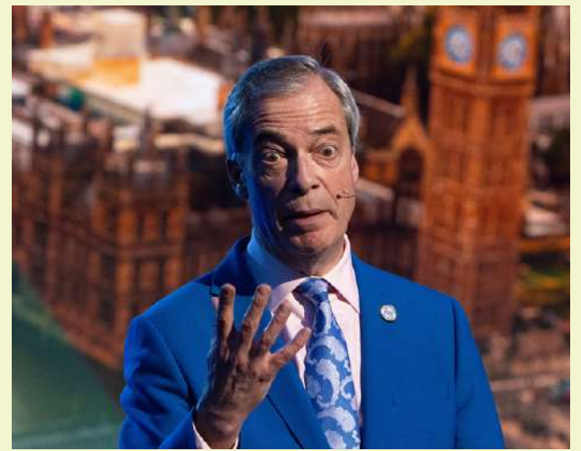
Photo: Farage claims "search parties" in the Maldives tried to stop him from reaching the Chagos Islands.

near a student event. His death has intensified political tensions ahead of next year's presidential election, with about 3,000 people marching in Lyon in tribute. President Emmanuel Macron called for calm. Seven individuals have received preliminary charges, including intentional homicide and criminal conspiracy. Barrot also said he plans to raise concerns over U.S. sanctions targeting French officials during his meeting with Kushner.