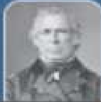
Zachary Taylor 12th President