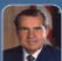
Richard M. Nixon 37th President