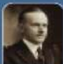
Calvin Coolidge 30th President