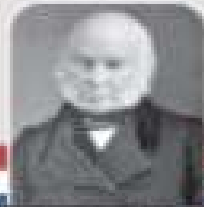
John Quincy Adams 6th President