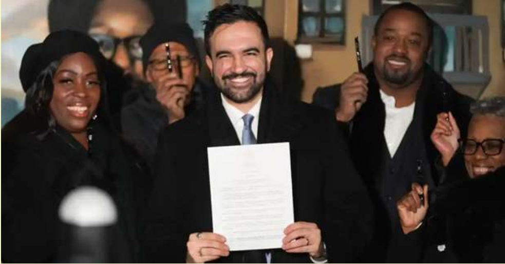
Photo: Bronx book haven Storyland inspires young readers