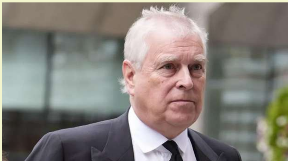
Photo: Emails show Met police protecting Prince Andrew during a visit to Jeffrey Epstein's home