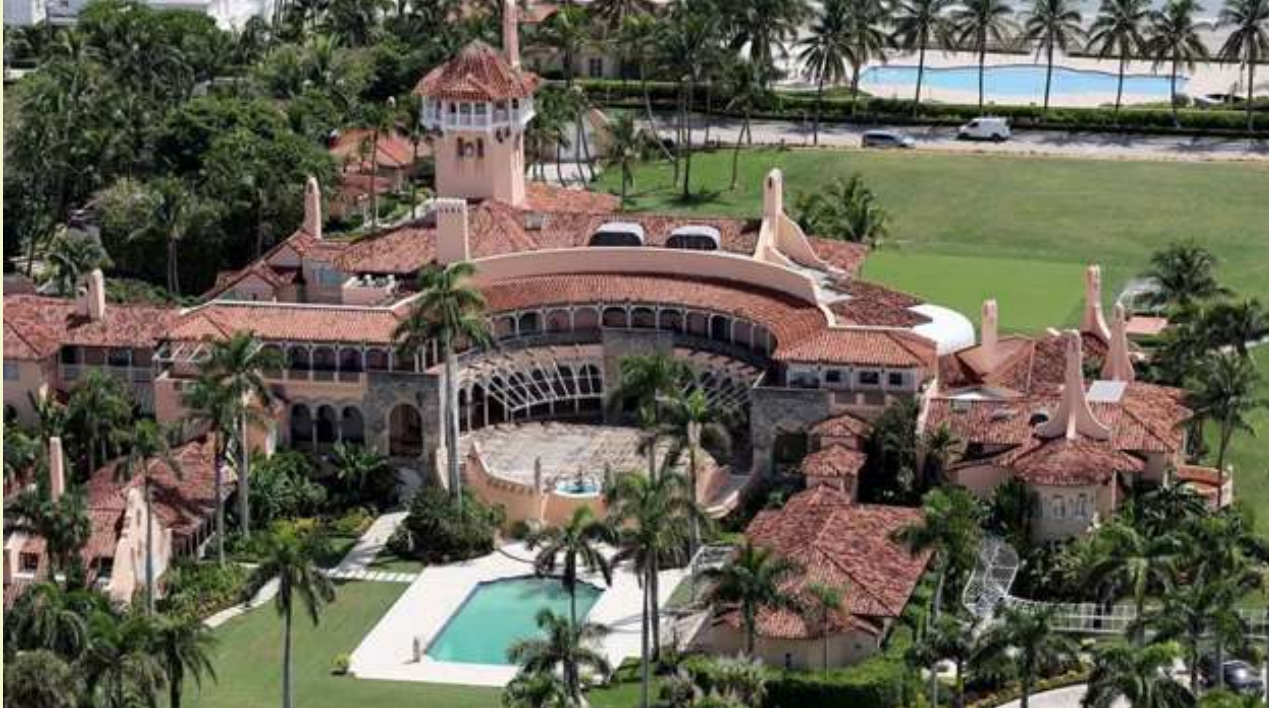
Photo: Secret Service responds after an armed man is killed near the secure perimeter of Trump's residence.

North Carolina, was reportedly carrying a shotgun and a fuel can when he approached the north gate of the property. Trump was in Washington, DC at the