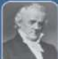
James Buchanan 15th President