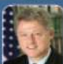
William J. Clinton 42nd President