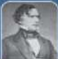
Franklin Pierce 14th President