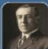
Woodrow Wilson 28th President