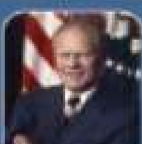
Gerald R. Ford 38th President