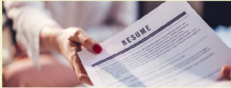
Photo: NYC is hiring: Jobs in Manhattan that don't require a degree DHS is also seeking a community associate to serve as an intake worker, acting as a liaison between residents and shelters. That position operates Tuesday through Saturday from 8 a.m. to 4 p.m., offering $44,545 to $51,227 annually. City officials say the openings provide accessible pathways into public service while supporting vulnerable New Yorkers through essential services.

New York City is expanding employment opportunities with several entry-level positions in Manhattan that do not require a college degree, according to listings on the official JobsNYC portal. The Department of Homeless Services (DHS) is hiring a full-time community assistant responsible for housekeeping duties, maintaining common areas and handling inventory. The role runs Sunday through Thursday from 12 p.m. to 8 p.m., with a salary range of $39,970 to $43,460.