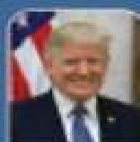
Donald J. Trump 45th President