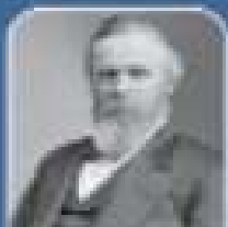
Rutherford B. Hayes 19th President