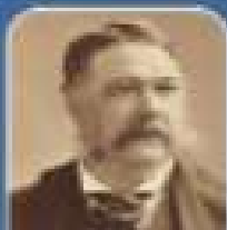
Chester A. Arthur 21st President