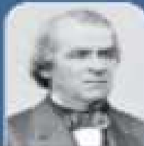
Andrew Johnson 17th President