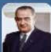
Lyndon B. Johnson 36th President