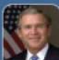
George W. Bush 43rd President