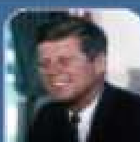
John F. Kennedy 35th President