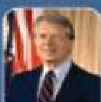
James E. Carter Jr. 39th President