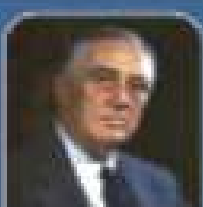
Franklin D. Roosevelt 32nd President