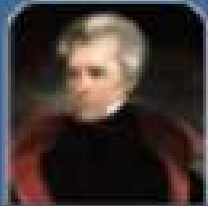
Andrew Jackson 7th President