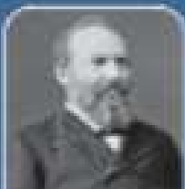
James A. Garfield 20th President