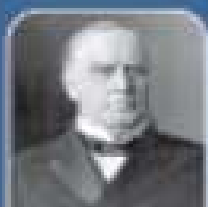
William McKinley 25th President