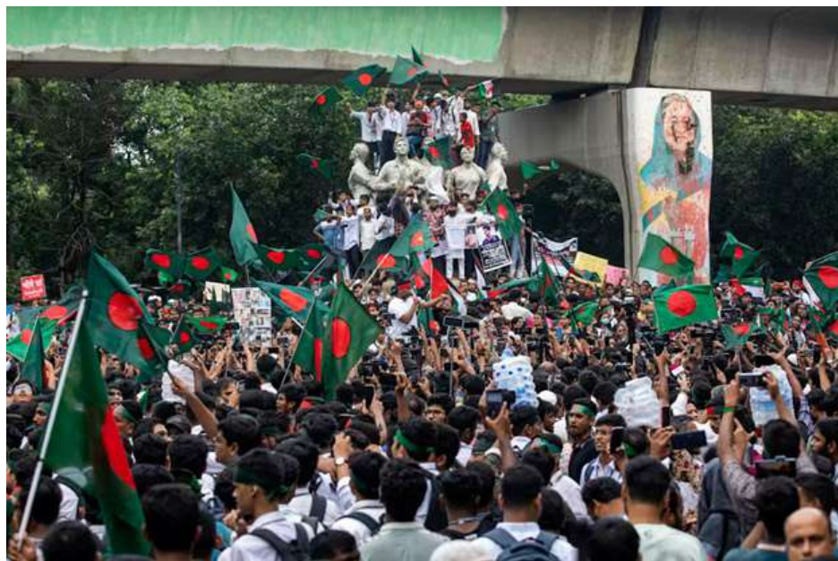
Photo: Bangladesh's election represents politics as usual, and some hope for change

“Are these engagements part of a broader strategy to consolidate democratic opposition? Or do they signal a gradual softening of long-held ideological boundaries?”