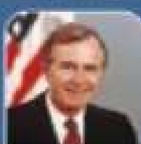
George H.W. Bush 41st President