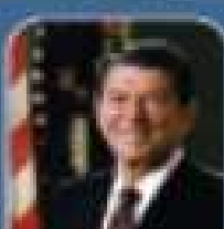
Ronald W. Reagan 40th President