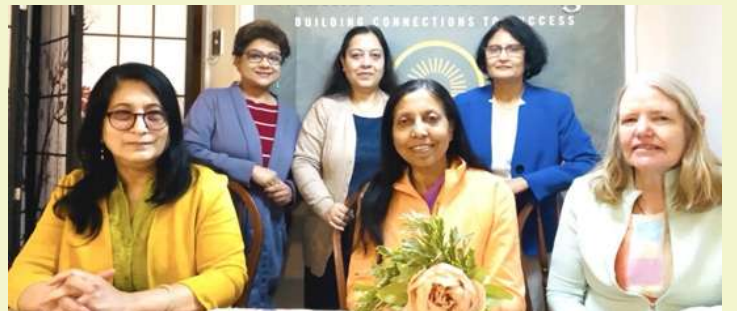
Photo: Mentor Power Village Celebrates First Anniversary