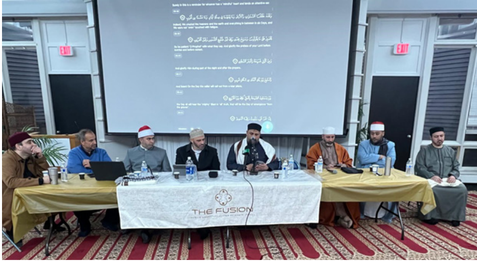
contemporary issues. The lineup of reciters included renowned